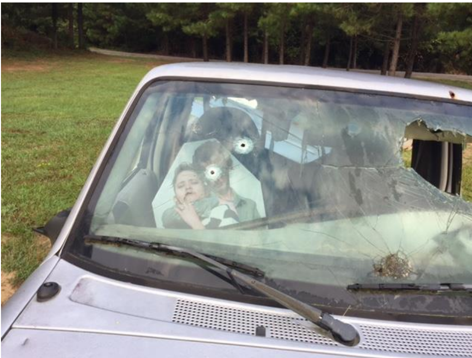
The lower round is the 9mm test round.