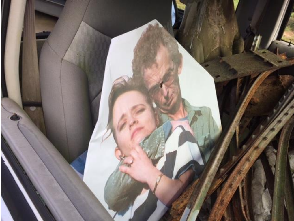
I deliberately fired the round from high to low to see the penetration.