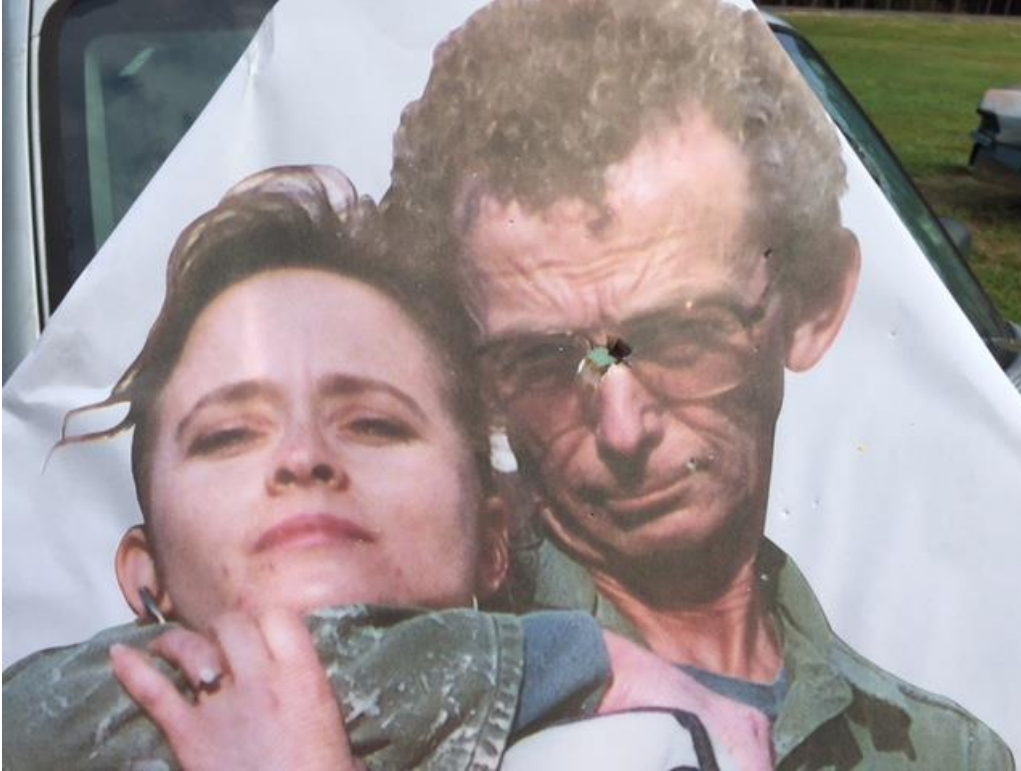
Fired from the front of the hood, the bullet went through the windshield, point of aim, point of impact.