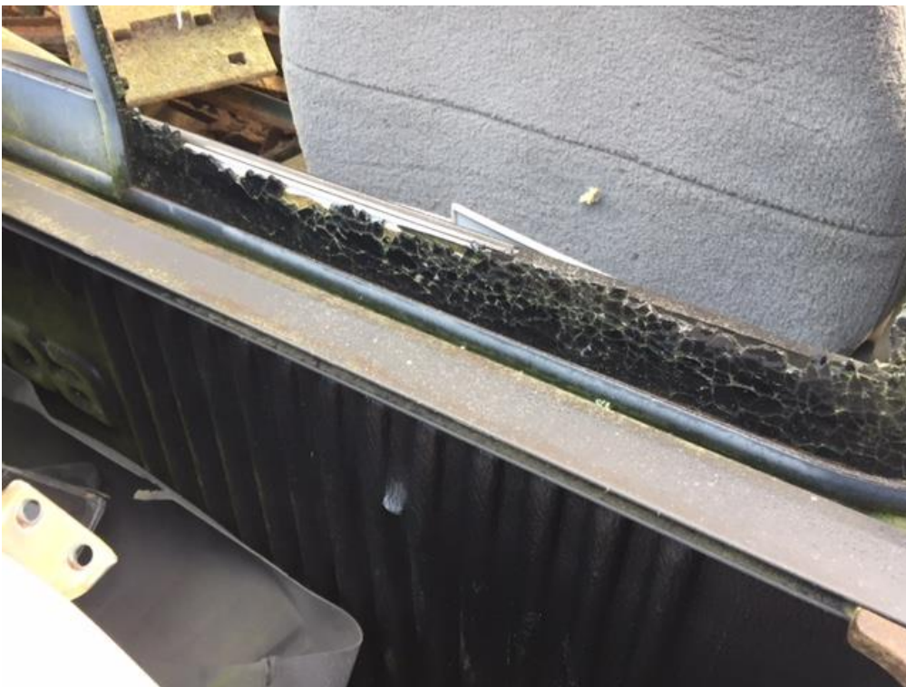
It went through the seat, through the skin of the truck and lodged into the outside bed of the truck, bulging out the bed liner.